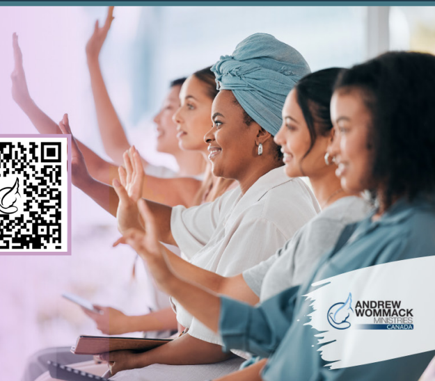
ANDREW WOMMACK MINISTERS CANADA

The information in this publication was accurate at the time of its release. However, due to the nature of printed materials, certain details may have changed since its production.