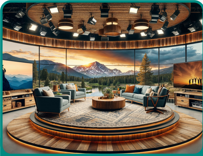
New look at one of the digital studios.