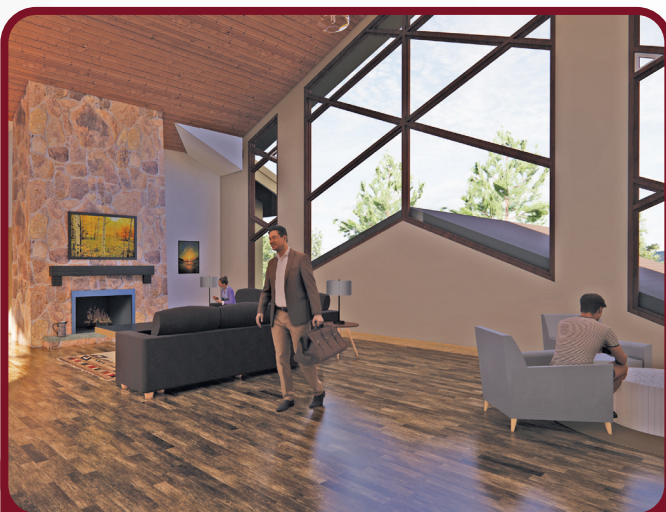
Digital rendering of the inside of a student housing building.

Imagine going to college not just to get training for a job, but to discover your life's purpose. That's what Charis Bible College is all about.