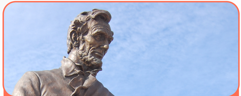
Abraham Lincoln's Emancipation Proclamation of 1863 freed slaves, but many in the Confederate States only learned of their freedom on June 19, 1865, known as Juneteenth.

the inmates, saying, “If I had the power to free you and I just opened the door and said, ‘You’re free!’ you’d be freed. But that doesn’t mean you’d be free . You have to believe you’re free and then act on it by getting off your bunk and walking out the door.”